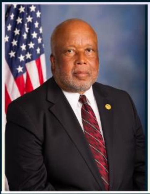
CONGRESSMAN BENNIE THOMPSON