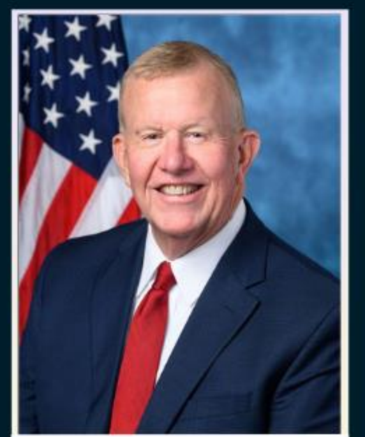
CONGRESSMAN MIKE EZELL