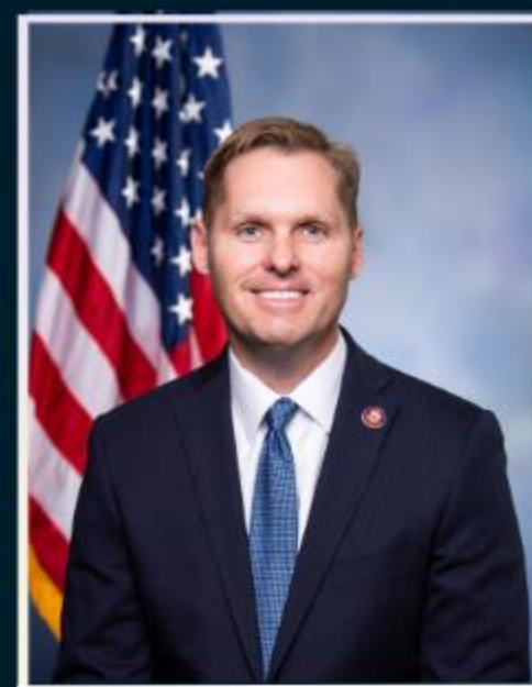
CONGRESSMAN MICHAEL GUEST