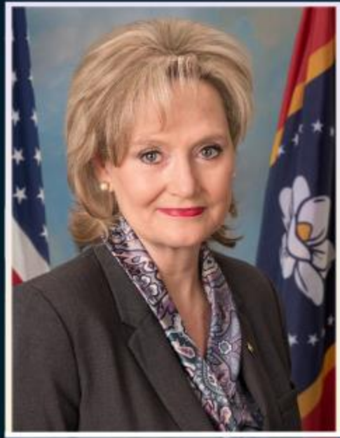
SENATOR CINDY HYDE SMITH