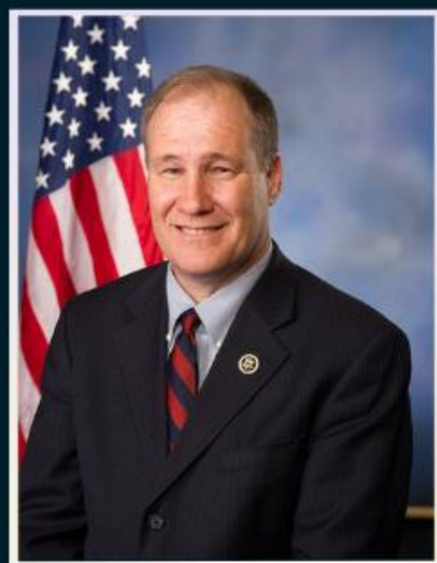
CONGRESSMAN TRENT KELLY